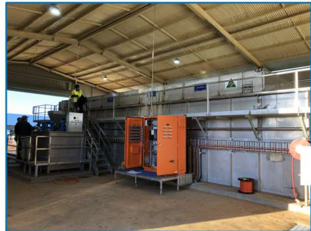
50 cu.m/h DAF Thickener Unit

All of these features make SWA's DAF units stand out from the rest.