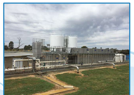
Dairy Factory WWT Plant