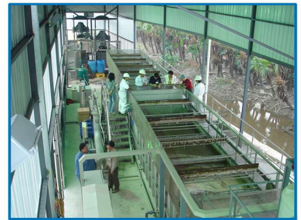
2 OFF 60 cu.m/hr DAF unit