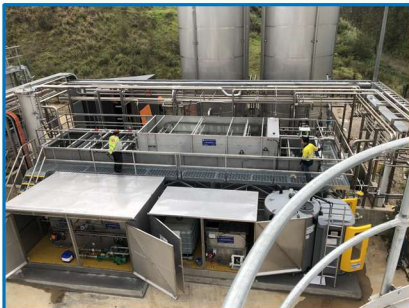
40 cu.m/hr DAF Treatment Plant