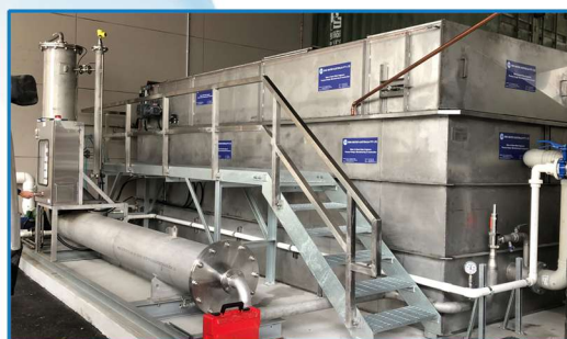
Darling Harbour Harbourside Shopping Centre DAF Treatment Plant