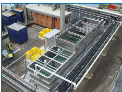
DAF with reaction & neutralisation tanks