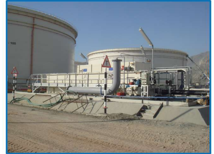
50 cu.m/hr Integrated CPI-DAF-EX Integral Oil Separator Explosion Approval Electricals