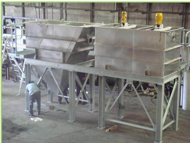
Solids Separator 10cu.m/hr with Reaction Tank