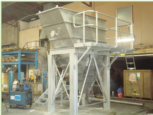
SWA CCS-20 Solids Separator 20cu.m/hr