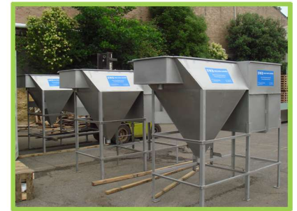
SWA CCS-5 Solids Separator 5cu.m/hr